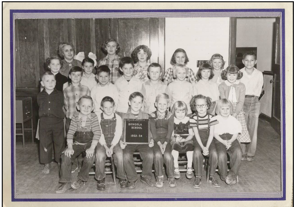
Dongola School 1953-54