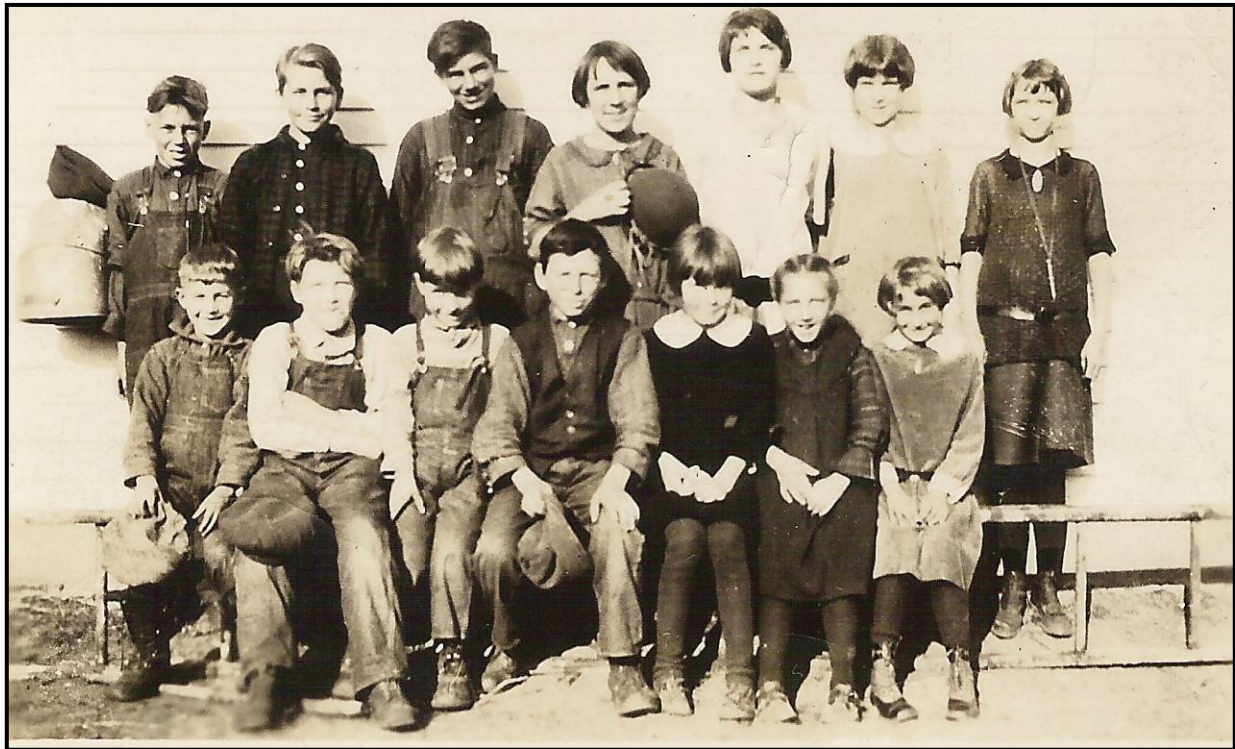
North Sand Lake School 1926