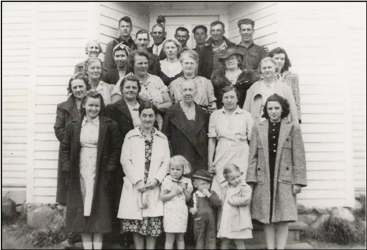
Viola Lake School Picnic May 20, 1942