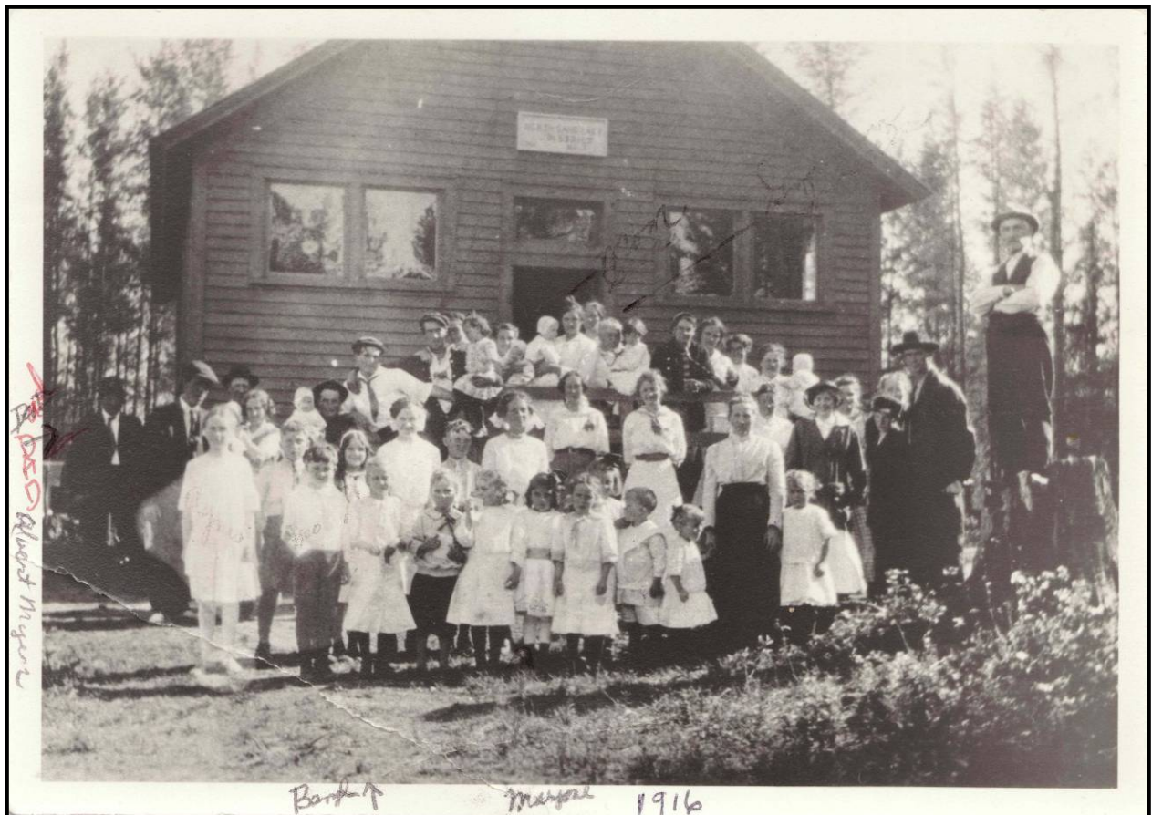
North Sand Lake School 1916