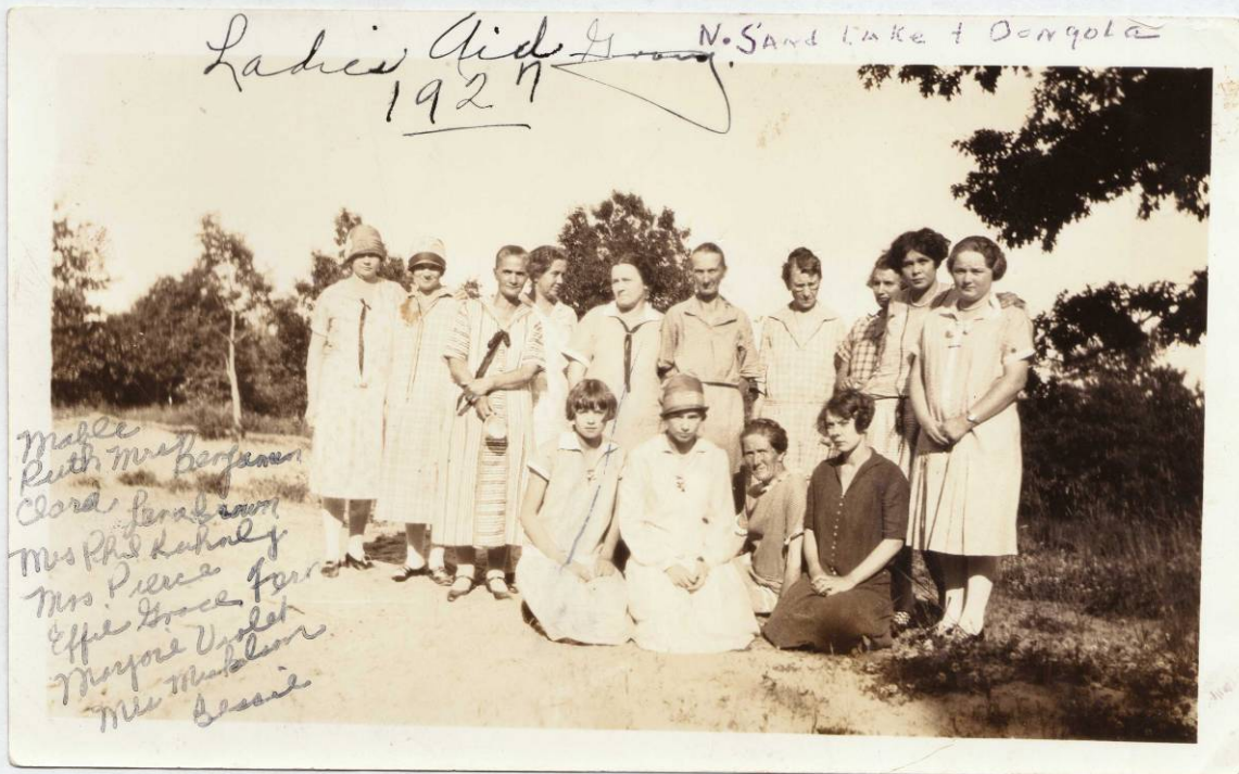
No. Sandlake and Dongola Homemakers group about 1927